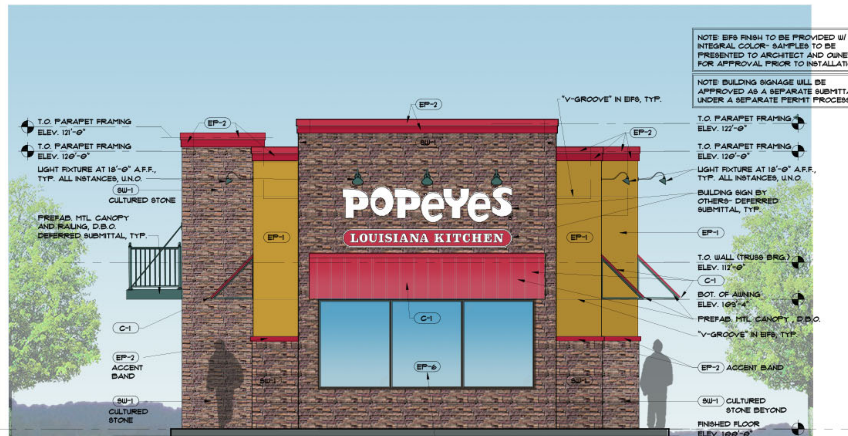
1 WEST ELEVATION 1/4"=1'-0"